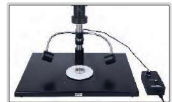
illumination direction and brightness are adjustable