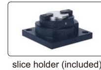
slice holder (included)