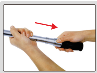
step 1: unlock