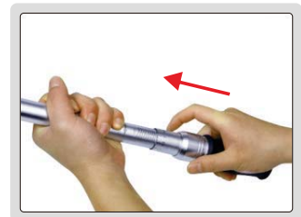
step 3: lock